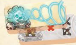
1 cardstock Skull token (for Baobab) Effect's explanation on the back