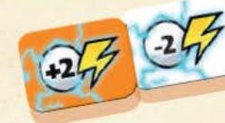
2 cardstock Electroshock tokens (for Burdock): one with a +2 and one with a -2