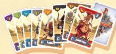
8 Warriorz Sheets with the Warrior displayed on one side and the Ultimate Warriorz logo on the back