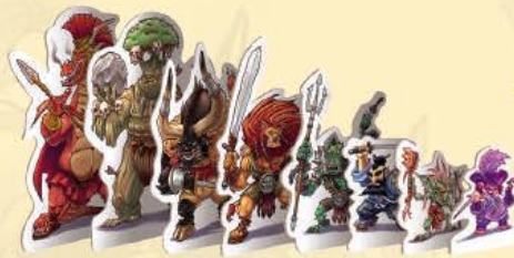
8 double-sided cardstock characters representing the "Ultimate Warriorz"