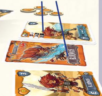
8 cardstock Lucky Charm tokens (one for each of the Warriorz)