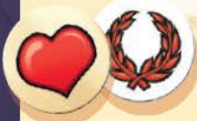
74 cardstock Life points/ Popularity points (LP/PP) tokens in 8 different colors (including 8 large "First Wound" tokens, one for each of the Warriorz) Hearts = Life Points (LP) Laurels = Popularity Points (PP)