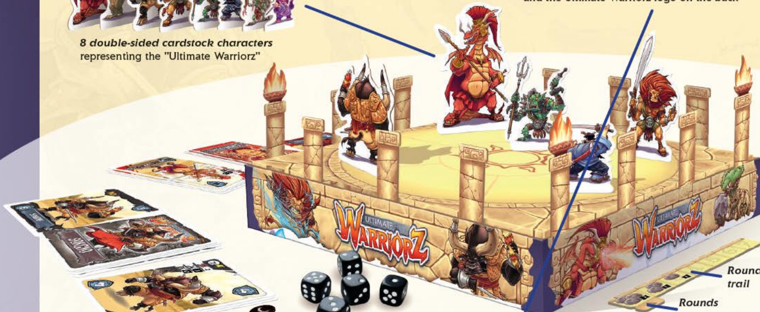
64 Action Cards Warriorz in action (see page 2) on front side / Name and color of the Warriorz on the back side