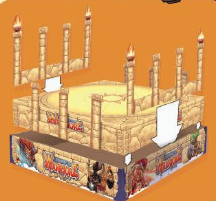
Combat arena Setup: Turn your closed box upside-down and insert the walls pieces with columns. Be sure to alternate the ones with flames and the ones without.